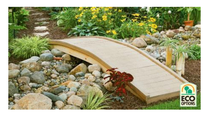
MATERIALS FOR VEGETATION

The vegetation that we chose is hardy to its location, add seasonal interest, has a large range of bloom times that add color to the space during the entire season, and be low maintenance.